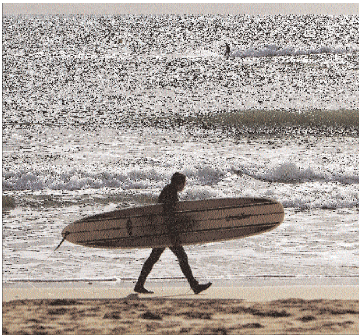
SURF'S UP: Experienced surfers will love the bigger waves at Boscombe after the opening of the reef. Right, riding with Jetski Safari and, below, the Hemingways at their retro beach pod

Cowboy promised to get us standing up by the end of the lesson